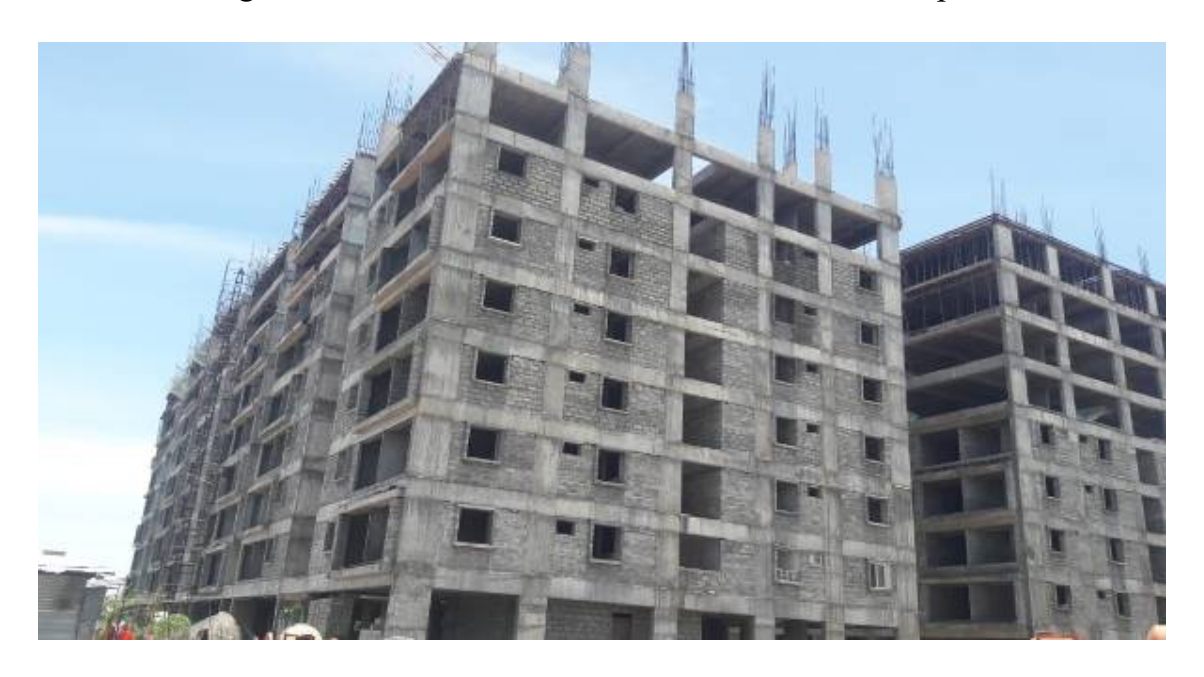
Block C2: Shuttering & Barbending works for 1<sup>st</sup> Half of Ninth floor level slab 75% completed and balance work on progress.

Block C1: Ninth floor level slab First half Concrete casting 100% completed. Slab Shuttering works in 2<sup>nd</sup> Half of Ninth Floor level 25% completed.