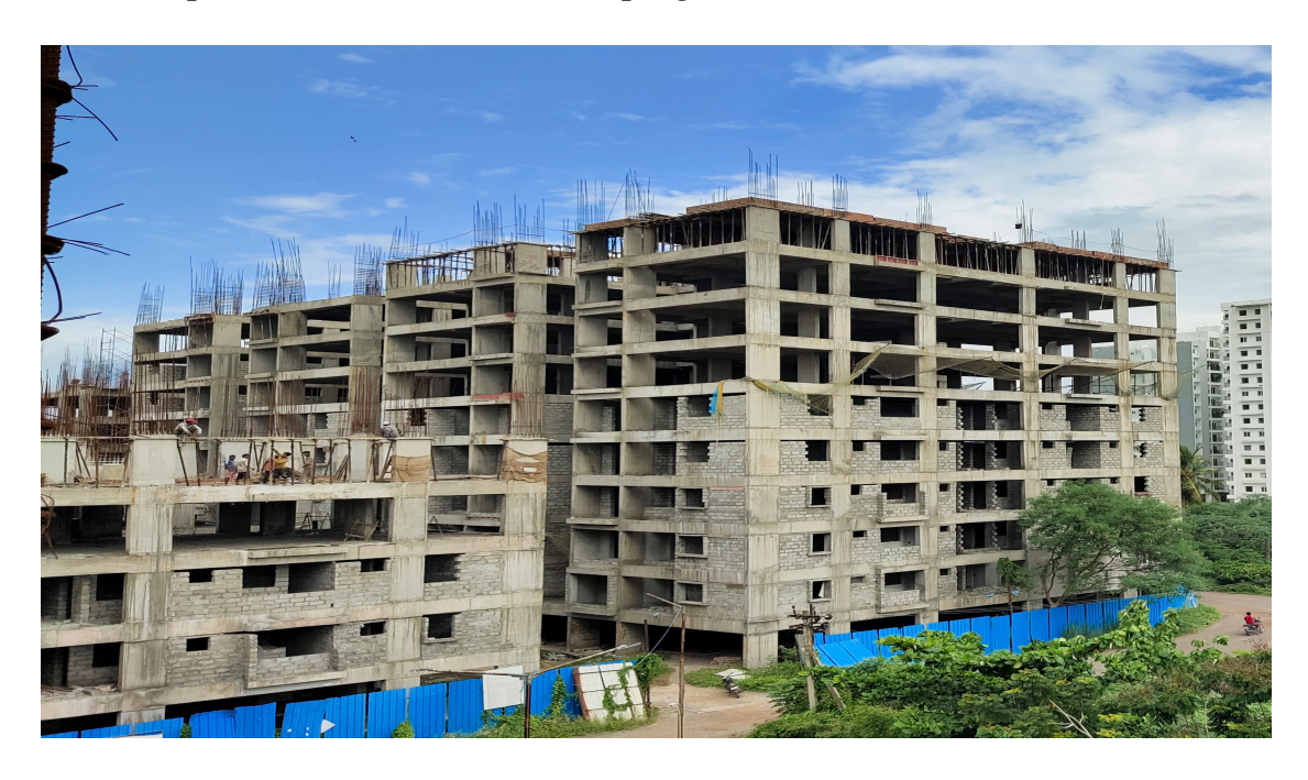
Block D3: Shuttering & Barbending works for 2<sup>nd</sup> Half of Seventh floor level slab 35% completed and balance work on progress.

Block D2: Shuttering & Barbending works for 1<sup>st</sup> Half of Tenth floor level slab 40% completed and balance work on progress.