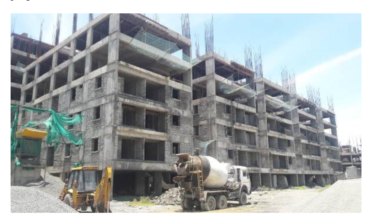
Block D1: Fourth Floor level slab concrete 100% completed. Shuttering & Barbending works for 1<sup>st</sup> half of Fifth Floor level slab 10% completed.

Block C3: Sixth Floor level slab concrete 100% completed. Barbending works for Column upto Seventh floor level 50% completed and balance works on progress.