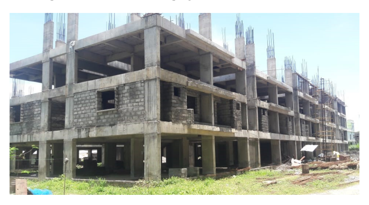
Block A2: Column concrete upto Third floor level 100% completed. Shuttering & Barbending works for 1<sup>st</sup> Half of Third floor level slab 65% completed and balance work on progress.

Block A1: Shuttering & reinforcement works in 1<sup>st</sup> half of Fourth Floor level slab 45% completed and balance work on progress.