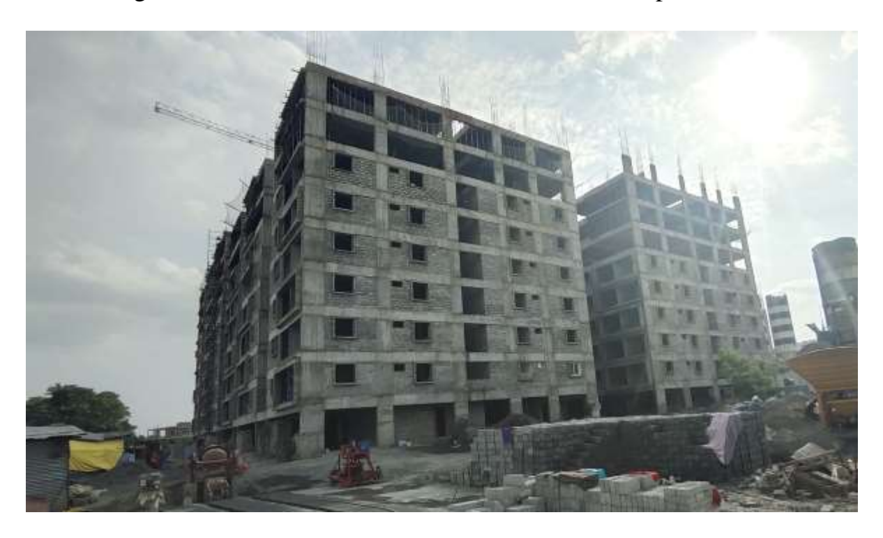
Block C2: Shuttering & Barbending works for 2<sup>nd</sup> Half of Ninth floor level slab 50% completed and balance work on progress. Columns upto Tenth Floor level 50% completed.

Block C1: Ninth floor level slab Concrete casting 100% completed. Shuttering & Barbending works in 1<sup>st</sup> Half of Tenth Floor level 95% completed.