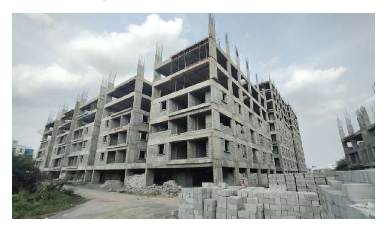
Block D1: Shuttering & Barbending works for 2<sup>nd</sup> half of Fifth Floor level slab 100% completed. Columns upto Sixth floor level 45% completed.