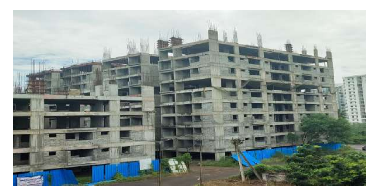
Block D3: Eight Floor Level slab 1<sup>st</sup> half concrete casting 100% completed. Shuttering & Barbending works for 2<sup>nd</sup> half of Eight floor level slab 25% completed and balance work on progress.

Block D2: Shuttering & Barbending works for 2<sup>nd</sup> Half of Tenth floor level slab 70% completed and balance work on progress. Columns upto Terrace floor level 10% completed.