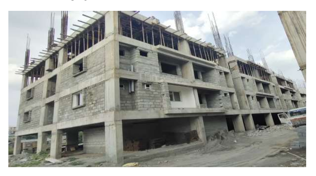
Block A2: Third floor level slab 1<sup>st</sup> half concrete 100% completed. Shuttering & barbending works in 2<sup>nd</sup> half of Third Floor level slab 70% completed and balance work on progress.

Block A1: Fourth floor level slab 1<sup>st</sup> half concrete 100% completed. Shuttering & reinforcement works in 2<sup>nd</sup> half of Fourth Floor level slab 30% completed and balance work on progress.