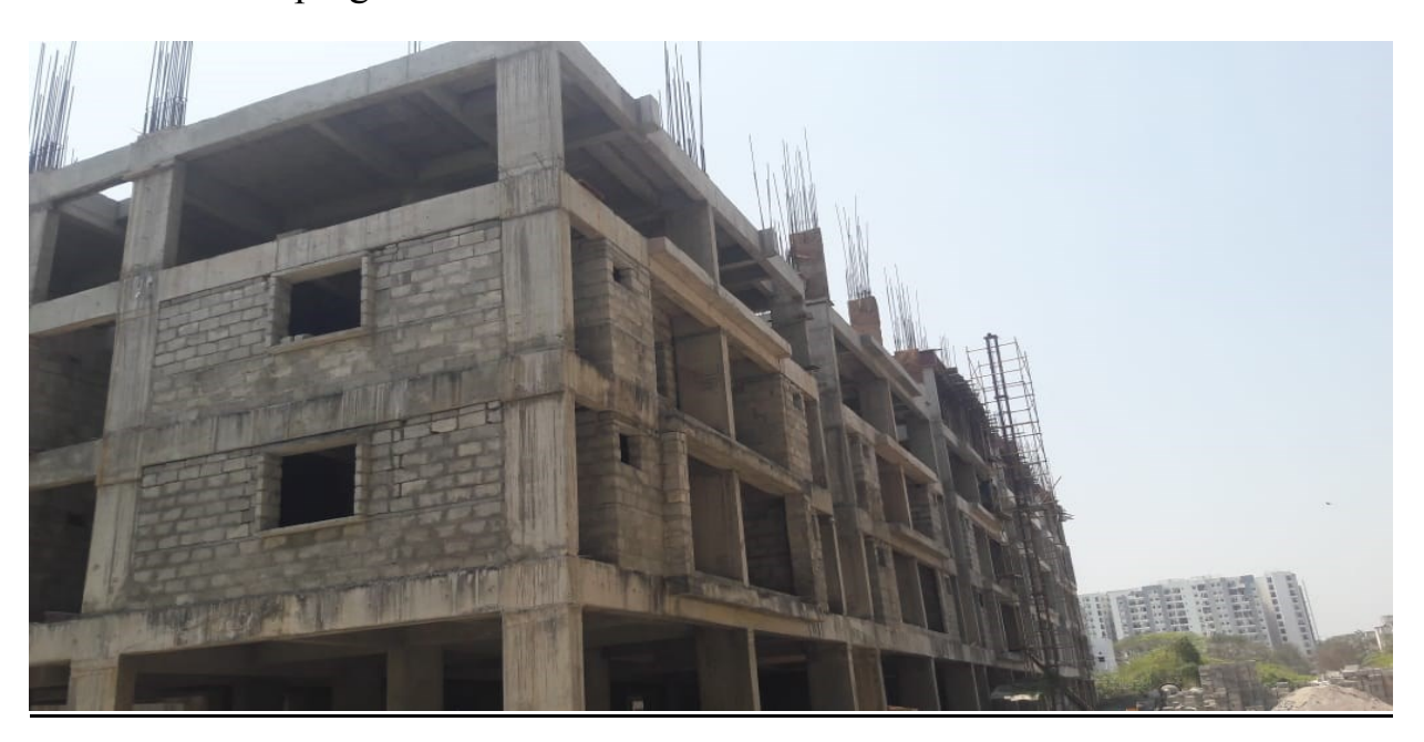
Block A2: Shuttering & barbending works in 2<sup>nd</sup> half of Fourth Floor level slab 80% completed and balance work on progress.

Block A1: Columns upto Fifth floor level 60% completed. Shuttering & reinforcement works in 1<sup>st</sup> half of Fifth Floor level slab 90% completed and balance work on progress.