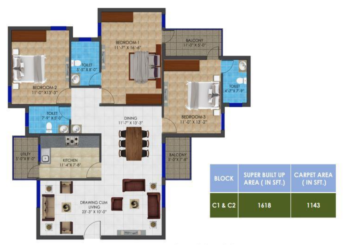
C1 & C2 -BLOCK