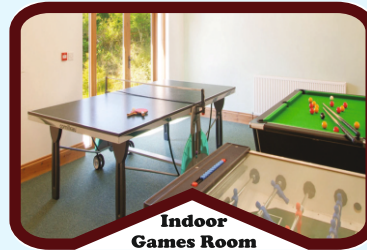
Indoor Games Room