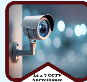
24 x 7 CCTV Surveillance