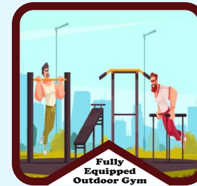
Fully Equipped Outdoor Gym