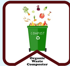
Organic Waste Composter