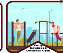
Fully Equipped Outdoor Gym