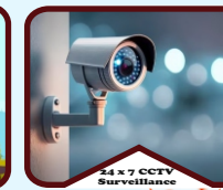
24 x 7 CCTV Surveillance