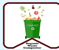
Organic Waste Composter