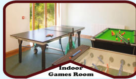
Indoor Games Room