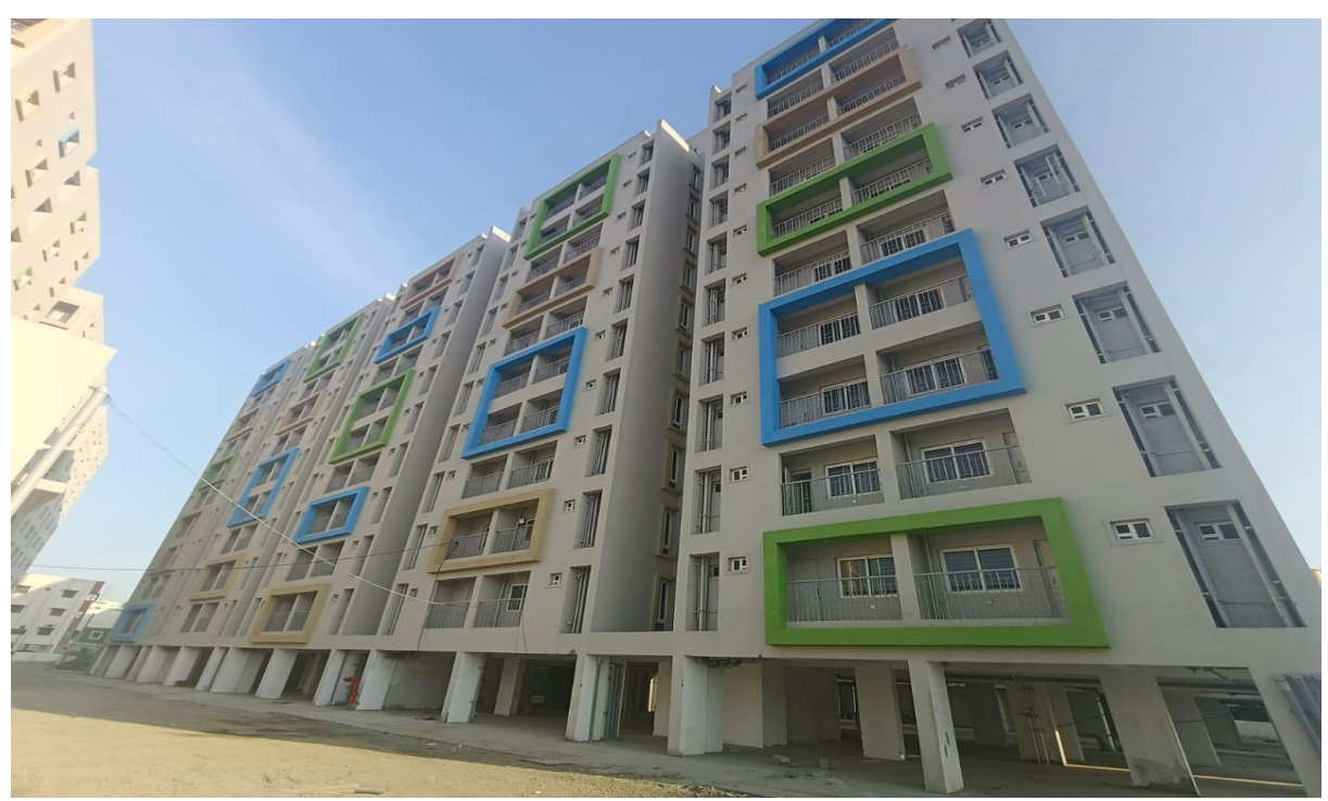
Block A1 – Front (South Side) Elevation