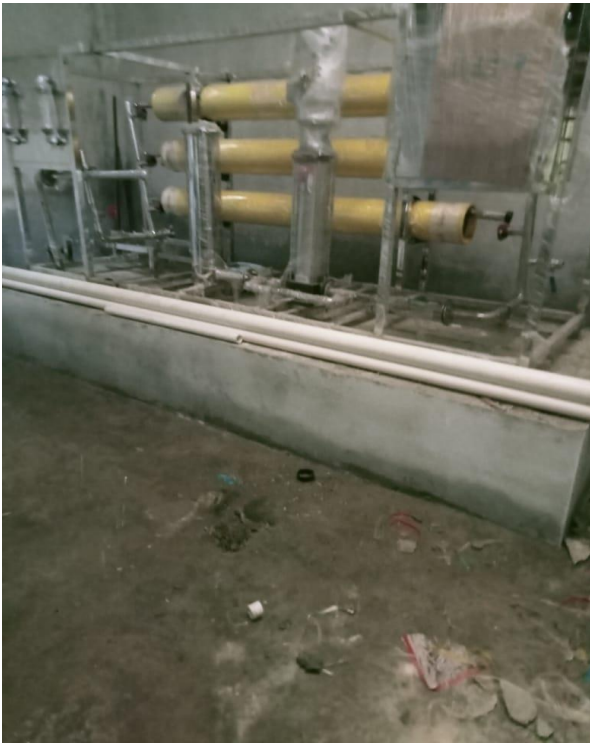
Under Ground Sump 2 (Near D1 Block). Installation of Pumps & installation of WTP completed. Testing of Pumps on progress.