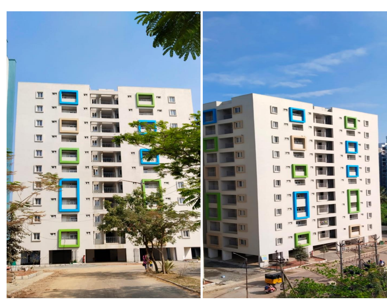
Block – D1