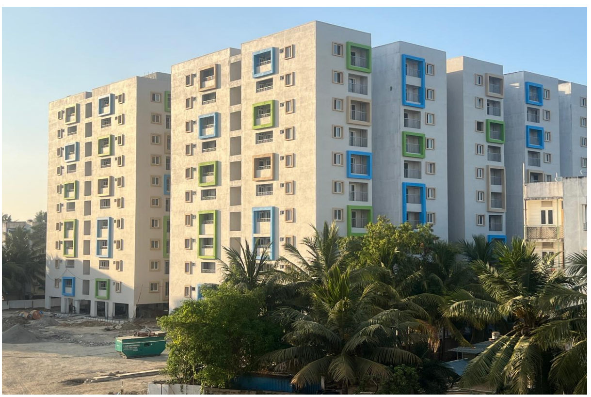
Block B2 – East side Elevation