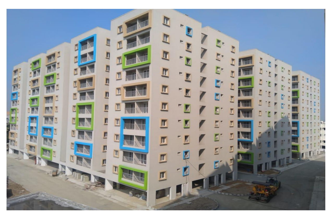
Block C1,C2 & C3 South Side Elevation