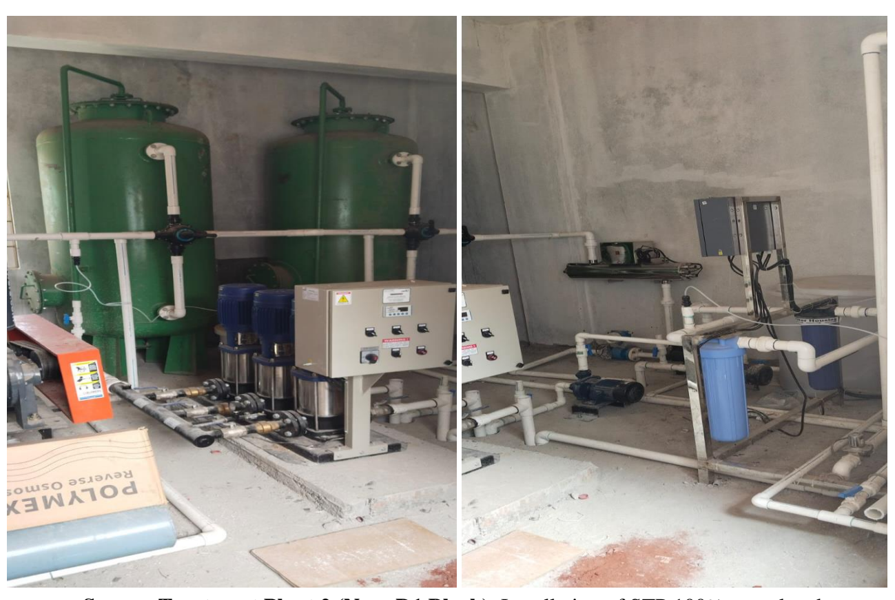
Sewage Treatment Plant 2 (Near D1 Block). Installation of STP 100% completed.