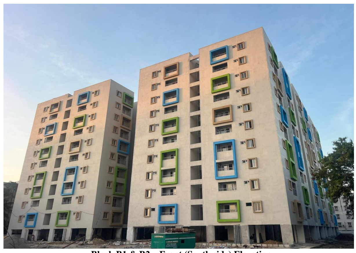
Block B1 & B2 – Front (South side) Elevation