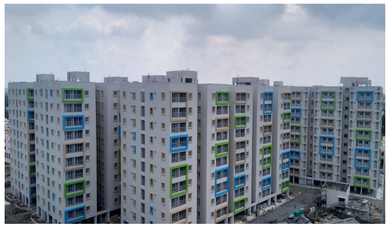
View of C1,C2,C3 West Side & A1 Block North Side Elevation