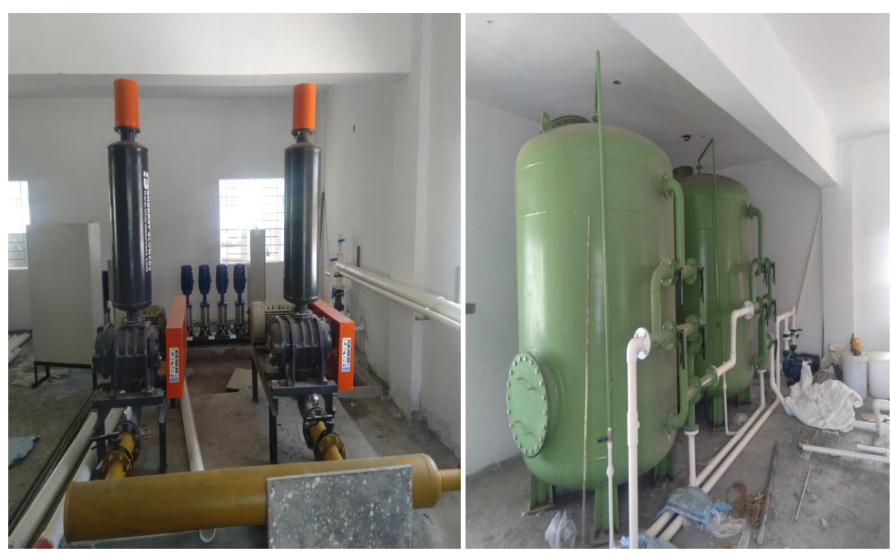
Sewage Treatment Plant 1 (Near C Block). Installation process of STP 85% completed.