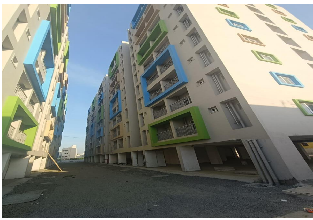
Road between A1 & A2 Block