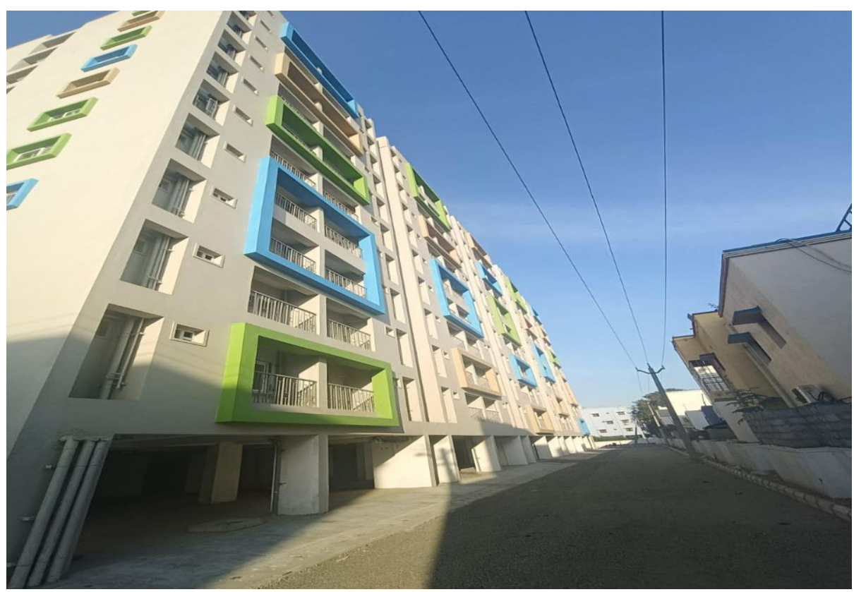
Block A2 – South side Elevation & Road work