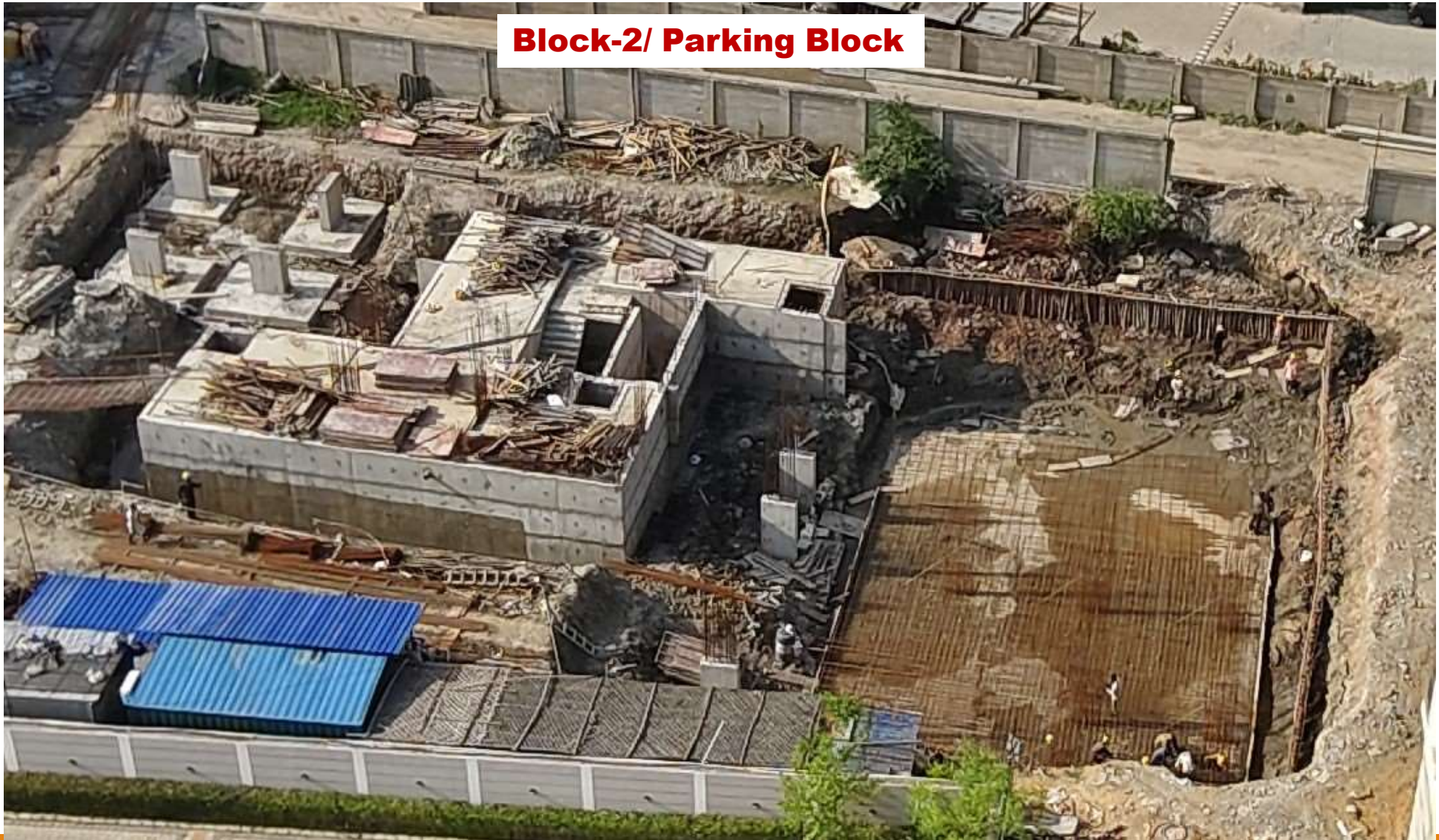
Block-2/ Parking Block