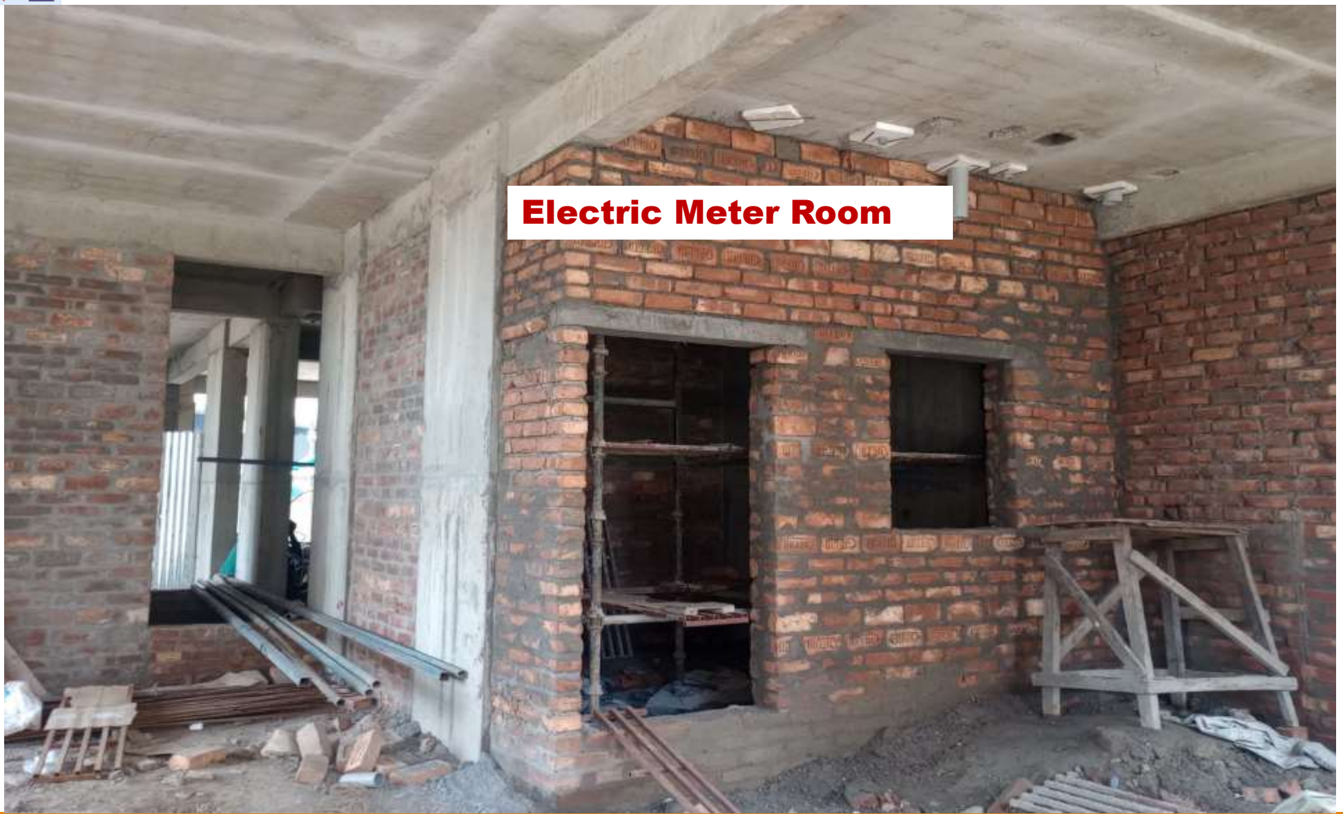
Electric Meter Room