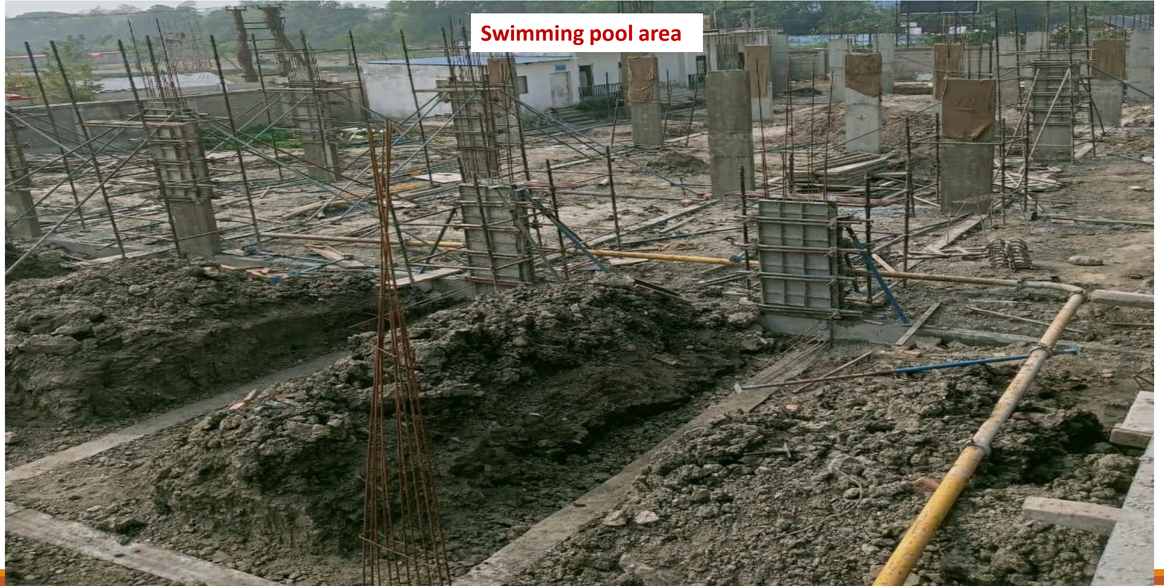
Swimming pool area