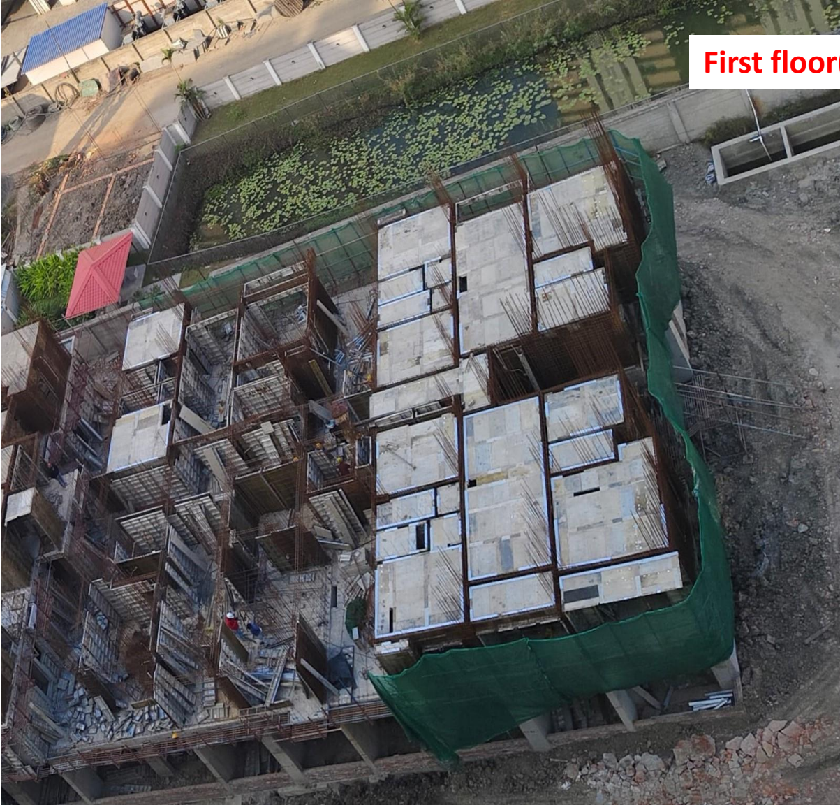
First floor(Part-3 )of Block/3 Type-N