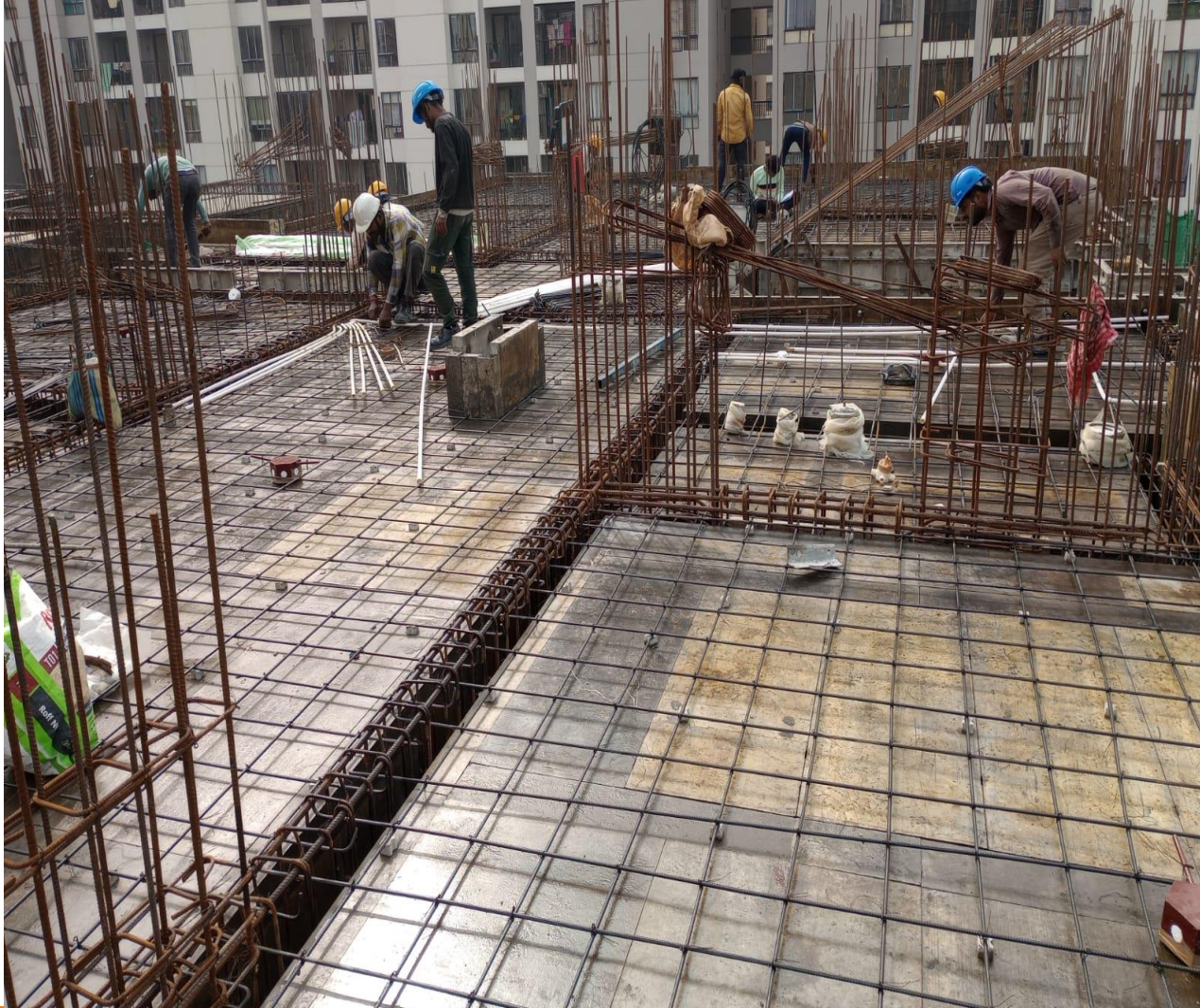
4 th floor roof slab(Part-1) of Block-3/Type-N